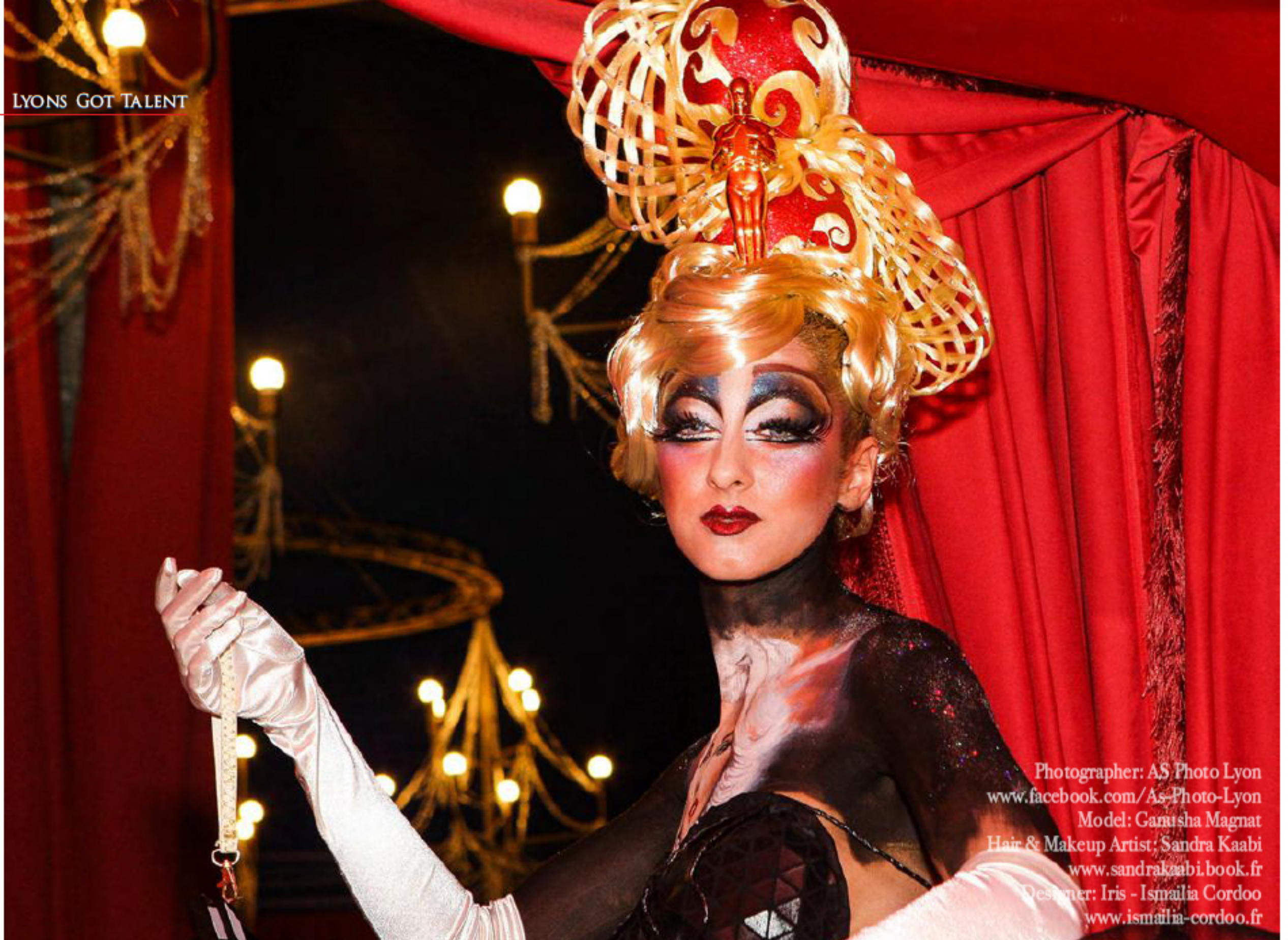
Model: Ganusha Magnat Hair & Makeup Artist: Sandra Kaabi www.sandrakaabi.book.fr Designer: Iris - Ismailia Cordoo www.ismailia-cordoo.fr

What type of woman do you have in mind when you are designing?